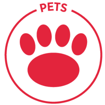
Mini Turbo Nozzle included