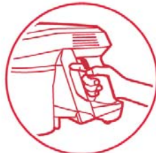
Pull the lever for continuous power