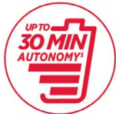
Up to 30 min of runtime