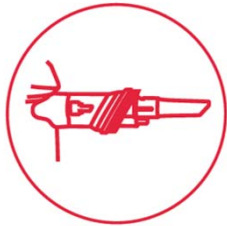
Tools on board