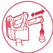
Removable battery pack to charge it anywhere