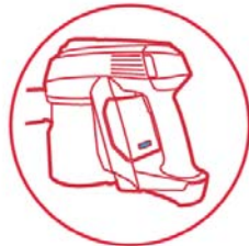
LED battery status indicator