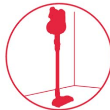
Quick Park&Go 3